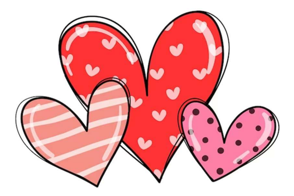
Join us for a Valentine's Day dance on Thu. Feb. 13 from 5:30 to 7 p.m. in our cafeteria. All grade levels are welcome and must be accompanied by an adult.